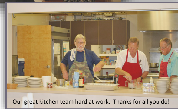
Our great kitchen team hard at work. Thanks for all you do!